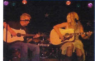
Nashville Nightlife Dinner Theater.