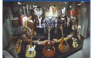
Country Music Hall of Fame.