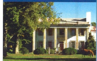
Belle Meade Historic Site & Winery.