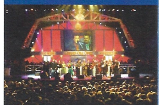
Famous Grand Ole Opry.